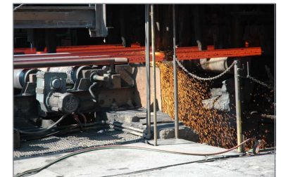
Steel rebar – reinforcing bar – is one of many industrial items manufactured in South Carolina. At CMC Steel in Cayce, rebar is made for residential and commercial construction and highways. The company has mills in eight other states and much of their production is from recycled scrap metal.

Tires, airplanes, automobiles: these are some of the products made in South Carolina today that were unheard of just 25 years ago. Improved technical education, communications, transportation, and business development policies have encouraged both home-grown industry and foreign investment. Non-durable goods such as textiles and food processing traditionally have led the way, but machinery and electronics also are important. Highly visible manufacturers include BMW (cars), Boeing (airplanes), and Michelin (tires). Shown here are industries employing more than 500 workers at their facility. Most are located near transportation networks. In particular a string of facilities follows Interstate 85 and creates a manufacturing corridor that links Atlanta, Anderson, Greenville, Spartanburg, Gaffney, and Charlotte.